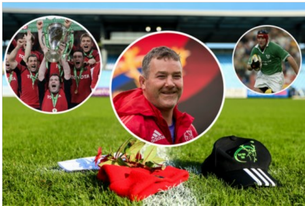
Munster legend Anthony 'Axel' Foley